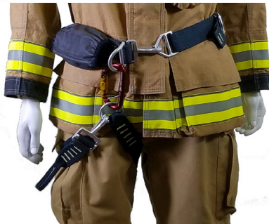
MUS used as a one-legged harness

Accessory pouches allow stowage of the Multi-Use-Strap as well as a multitude of firefighter accessories such as tethers, gloves, etc.