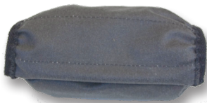
Accessory Pouch: 1101-0080

Accessory pouches allow stowage of the Multi-Use-Strap as well as a multitude of firefighter accessories such as tethers, gloves, etc.