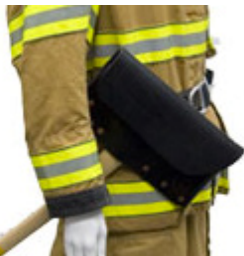
Half Scabbard: 1105-0024

Use caution when donning/doffing your belt with an axe scabbard. Tool may fall and cause serious injury.