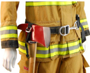
Axe/Tool Holder: 1101-0075

Use caution when donning/doffing your belt with a tool in the Axe/Tool Holder. Tool may fall and cause serious injury.