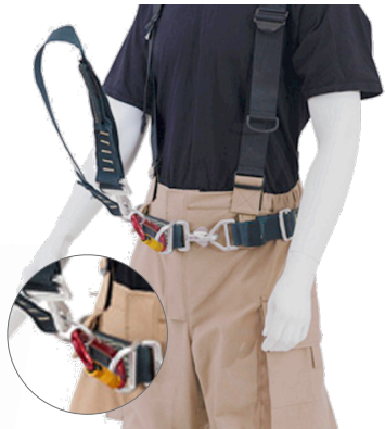
MUS used as a Ladder strap